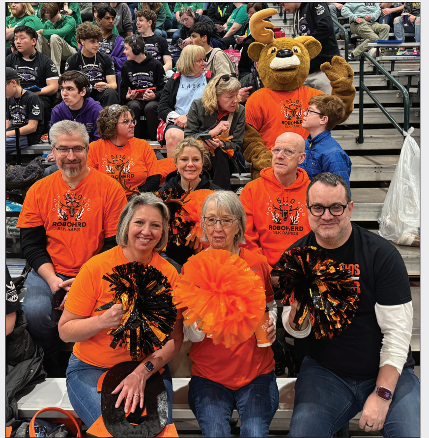
Roboherd families cheer on the team.

FIRST in Michigan seeks to inspire young people to be science and technology leaders and innovators. Their mission is to establish a sustainable robotics competition team at every high school in the state. Teams compete in qualifying district events, with winners being determined by a point system. The 160 top-ranked teams advance to the state championship. Winners at the state level will advance to the FIRST championship in Houston.